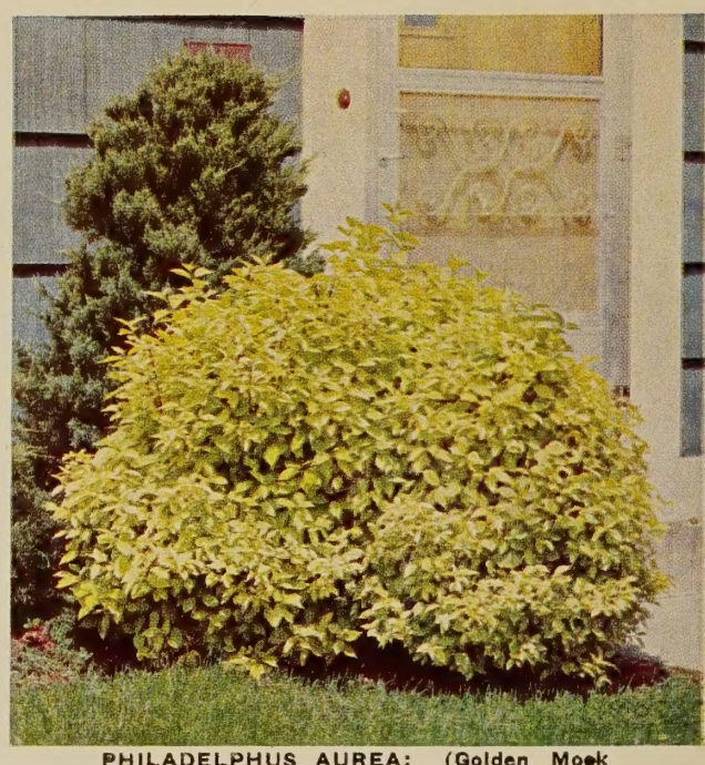
PHILADELPHUS AUREA: (Golden Mook Orange) Grows to a height of only 8-5 feet 15—18 inch plants each $1.70

TURN TO INSIDE PAGE FOR COMPLETE LIST OF ROSE VARIETIES WE HAVE TO OFFER.